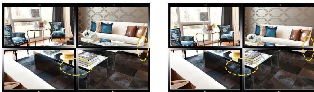
Edge Blanking Function

Without the edge blank function, all the display unit joints would have a frame gap which would make the image rip up in vision and feel unnatural. The image would be more natural and lively with the edge blanking function. An example of the transformation and its correction is as shown below.